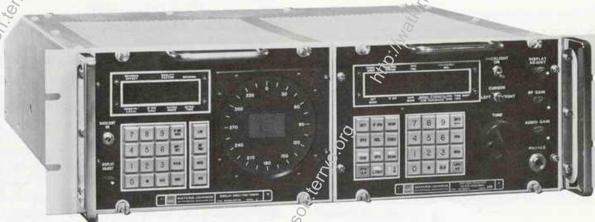
Figure 2: WJ-9040 DDF102 With WJ-8628-4 Receiver