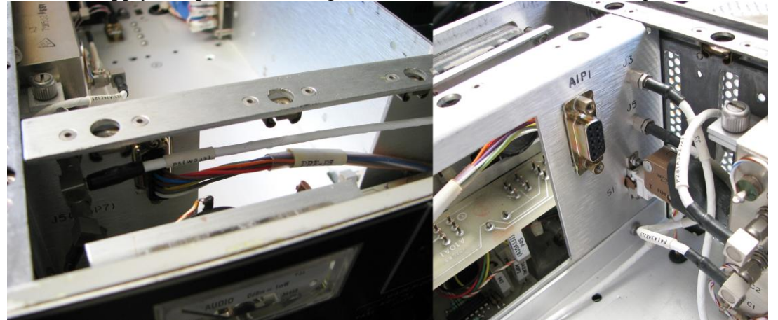
Figure 03: Routing the multipole cable in the receiver front (left picture) and installing the 9-pin sub-D connector in place (right picture). Please don't worry if your receiver is not provided with that large squared hole in the chassis, not all the WJ-8716/8718's have it!

2) Ascertain that the multipole cable passes in the front section of the receiver freely enough and then fasten the 9-pin sub-D connector to the receiver chassis (thru the proper hole that faces the Input and Power Supply compartment) using two UNC 4-40 screws, look at Figure 03 below.