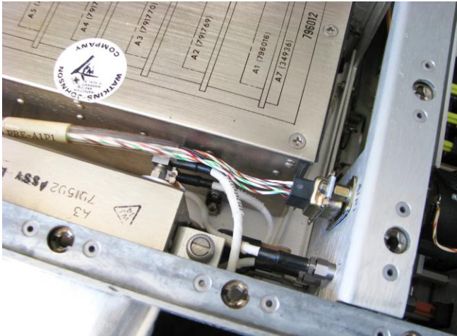
Figure 05: The Preselector 9-pin sub-D plug connected and fastened to its companion socket.

6) Connect the 9-pin sub-D plug that is at the end of the multipole cable coming from the Preselector unit to the 9-pin sub-D socket that had been previously fastened to the receiver chassis (Step 2 above); fasten the two fixing screws tightly enough for a secure pin contact, see Figure 05 below.