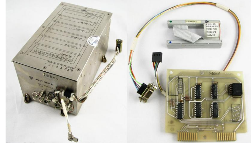
Figure 01: All the Preselector Option parts.

- the PRE-W2 flat cable assembly (provided with two female connectors) that has to be installed in the bottom of the receiver.