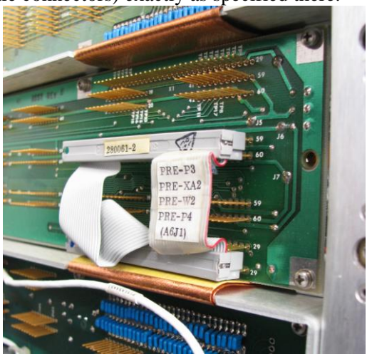
Figure 06: The PRE-W2 Cable assembly installed in the bottom of the A6 mainboard.

7) Place the receiver so that the bottom part of its chassis is accessible and locate A6J1 and A6X4 in the bottom of the A6 I/O mainboard. Please ascertain to locate these parts <u>exactly</u>. Attentively read the Dave Schofield's very interesting article that appears at the Web address: <u>http://www.ra1792.co.uk/radios/80s/pre_option.pdf</u> and place the pre-assembled PRE-W2 (flat cable terminated with two 64-pin female connectors) exactly as specified there.